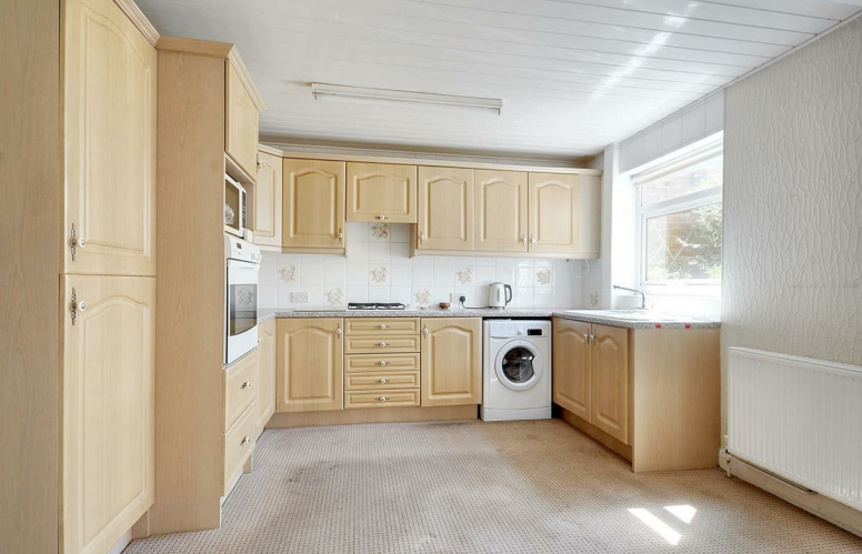
Nursery Road Arnold, Nottingham NG5 7ET