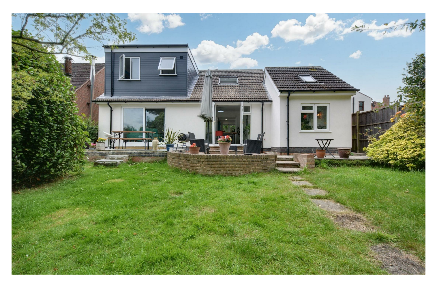
THIS IS A RECENTLY EXTENDED AND RE-DESIGNED INDIVIDUAL DETACHED PROPERTY WHICH NOW PROVIDES UP TO FIVE BEDROOMS WITH FOUR BATH/SHOWER ROOMS AND SPACIOUS OPEN PLAN LIVING ACCOMMODATION.

Being located on Whatton Road in Kegworth, this individual detached house has over recent months undergone a complete transformation programme and now provides a spacious family home which has flexible accommodation on the ground floor, with two rooms which have en-suite's that could be used as a lounge and office, or alternatively as additional bedrooms. For the size and quality of the accommodation and privacy of the large rear garden at the rear to be appreciated, we recommend that interested parties do take a full inspection so they are able to see all that is included in this lovely, spacious home for themselves. Kegworth is a desirable location situated between Nottingham, Derby and Leicester which has a number of local amenities and facilities, with all those provided by nearby towns within easy reach as are excellent transport links, all of which have helped to make this a very popular and convenient location to live.