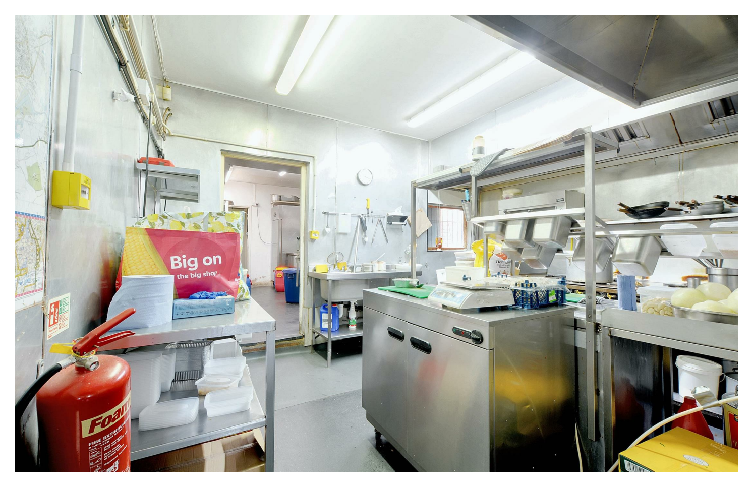
*** MIXED-USE INVESTMENT DWELLING ***

Robert Ellis are pleased to bring to the market this unique opportunity. Fronting a busy road in the residential area of Sherwood, this prominent building offers a flexible investment with a retail area on the ground floor with a further duplex apartment above including a garden to the rear.