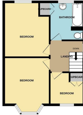
1ST FLOOR 452 sq.ft. (42.0 sq.m.) approx.