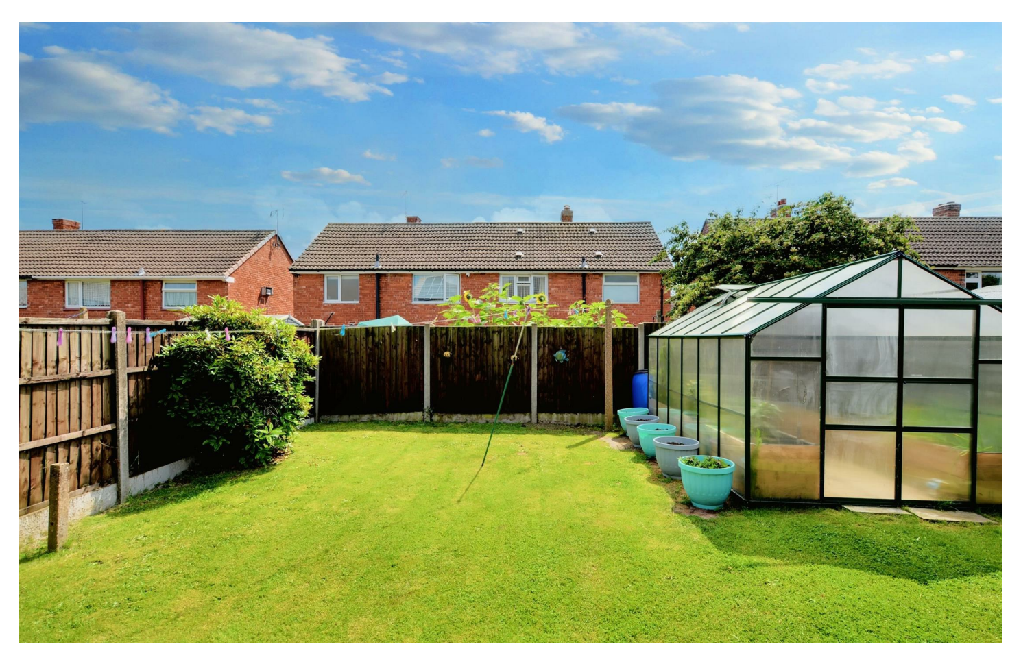
** Ideal Family Starter Home **

Robert Ellis Estate Agents are delighted to bring to the market a three bedroom, semi-detached family home located in Calverton, Nottingham.