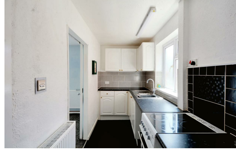
Beck Avenue Calverton, Nottingham NG14 6JG