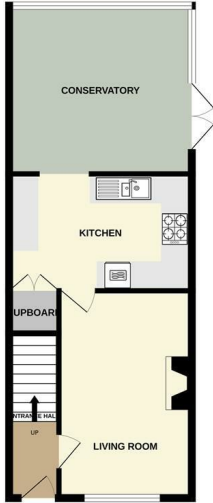
GROUND FLOOR 496 sq.ft. (45.1 sq.m.) approx.