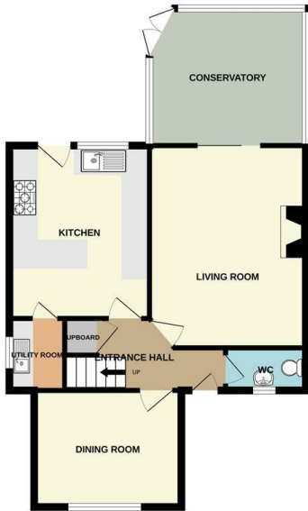
GROUND FLOOR 645 sq.ft. (59.9 sq.m.) approx.