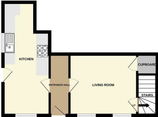
GROUND FLOOR 356 sq.ft. (33.1 sq.m.) approx.