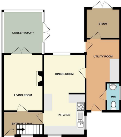
GROUND FLOOR 678 sq.ft. (63.0 sq.m.) approx.