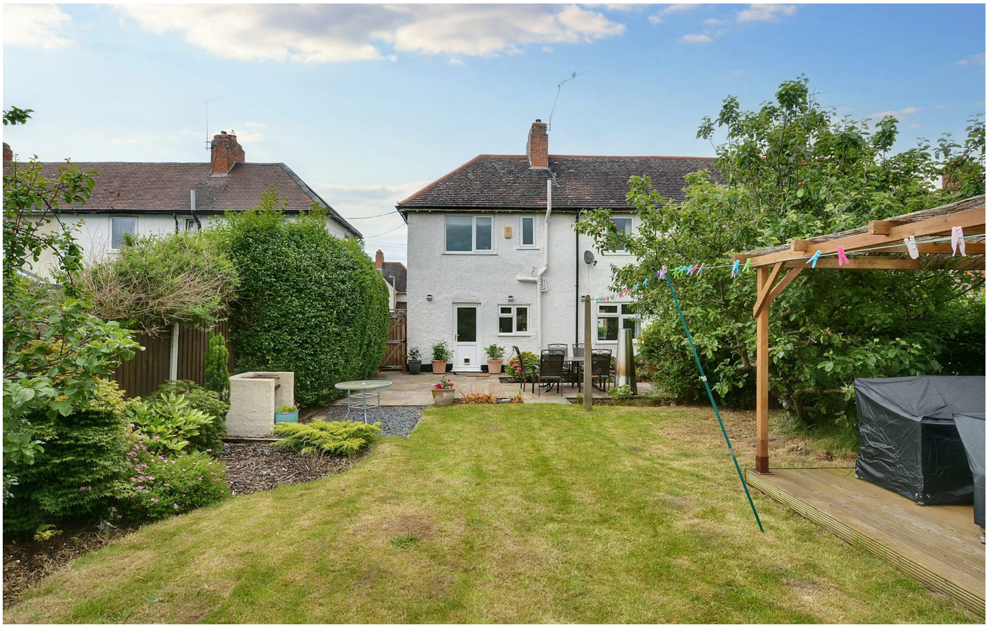
A Spacious three-bedroom semi-detached house.

Situated in this sought-after and convenient residential location, within easy reach of a variety of local shops and amenities including: schools, transport links, The University of Nottingham, and Queens Medical Centre, this fantastic property is considered an ideal opportunity for a range of potential purchasers including: first time buyers, young professionals, families, and investors.