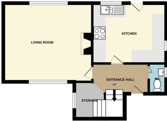
GROUND FLOOR 394 sq.ft. (36.6 sq.m.) approx.