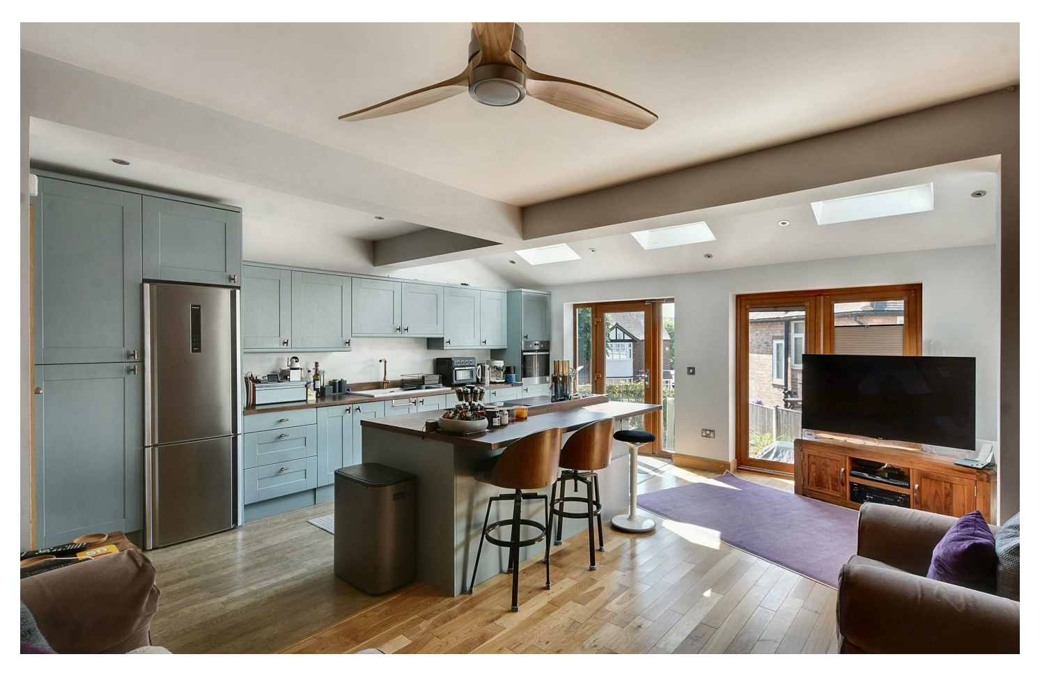
***GUIDE PRICE £315,000 - £325,000***

Robert Ellis Estate Agents are delighted to offer to the market this beautiful THREE BEDROOM DETACHED FAMILY HOME situated in the desirable location of Woodthorpe, Nottingham.