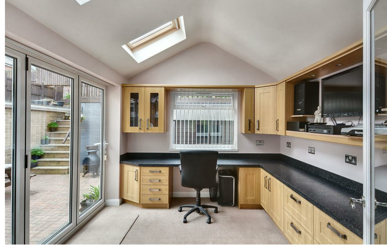
Starch Lane Sandiacre, Nottingham NG10 5EB