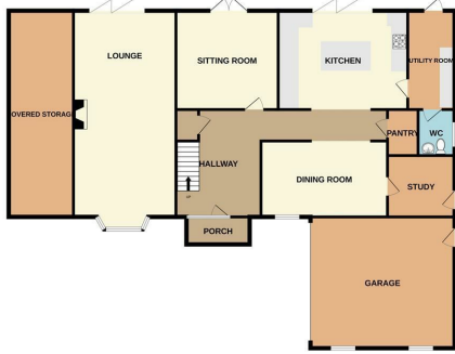
GROUND FLOOR 2055 sq.ft. (190.9 sq.m.) approx.