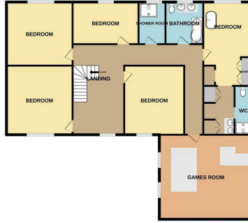
1ST FLOOR 1777 sq.ft. (165.0 sq.m.) approx.