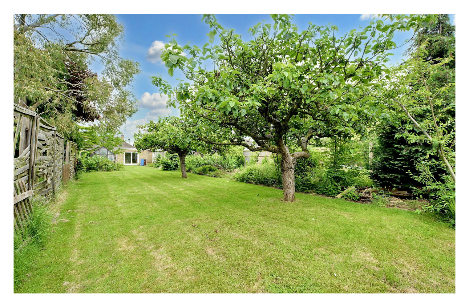
A TWO/THREE BEDROOM SEMI DETACHED BUNGALOW, FOUND IN A CUL-DE-SAC LOCATION WITHIN THIS DESIRABLE VILLAGE.

Robert Ellis are delighted to bring to the market this semi detached bungalow on Harrimans Drive which requires upgrading. Offering an extensive lawn rear garden which occupies two apple trees, this property cannot be missed. There are two/three bedrooms on offer with key benefits of the property that include an extension at the rear, multi fuel log burner, detached garage and parquet flooring in the hallway as well as a bay fronted bedroom. The bungalow is positioned with easy access to the centre of Breaston village where there are a number of shops, healthcare facilities and the village is within close proximity to excellent transport links.