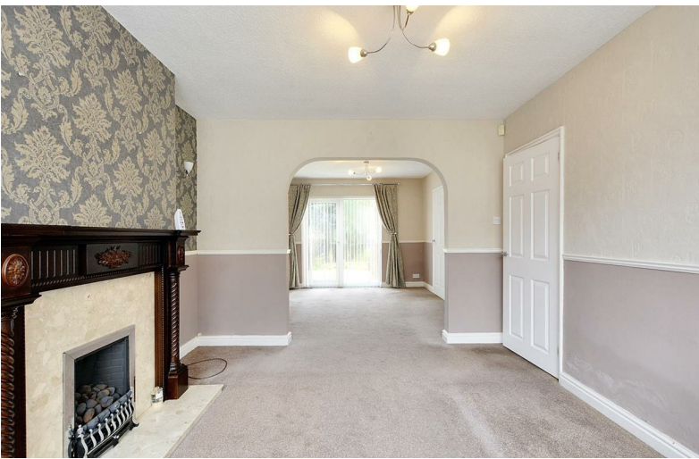
Sefton Avenue Stapleford, Nottingham NG9 8EA