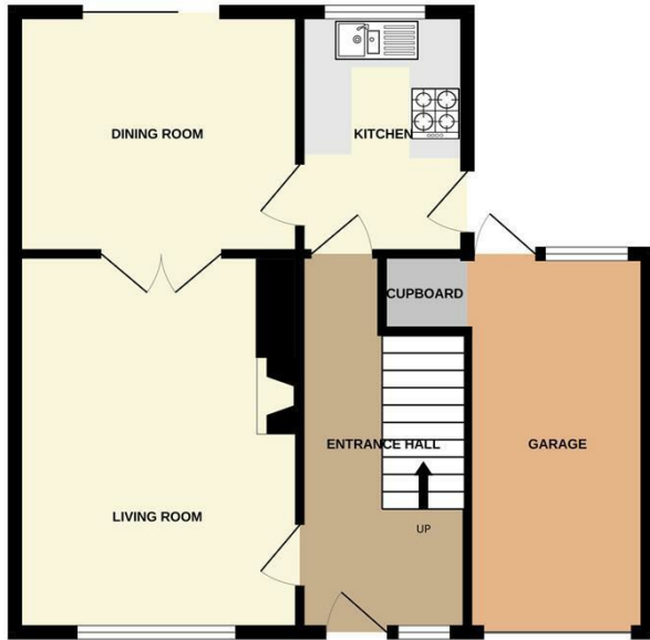
GROUND FLOOR 577 sq.ft. (53.6 sq.m.) approx.