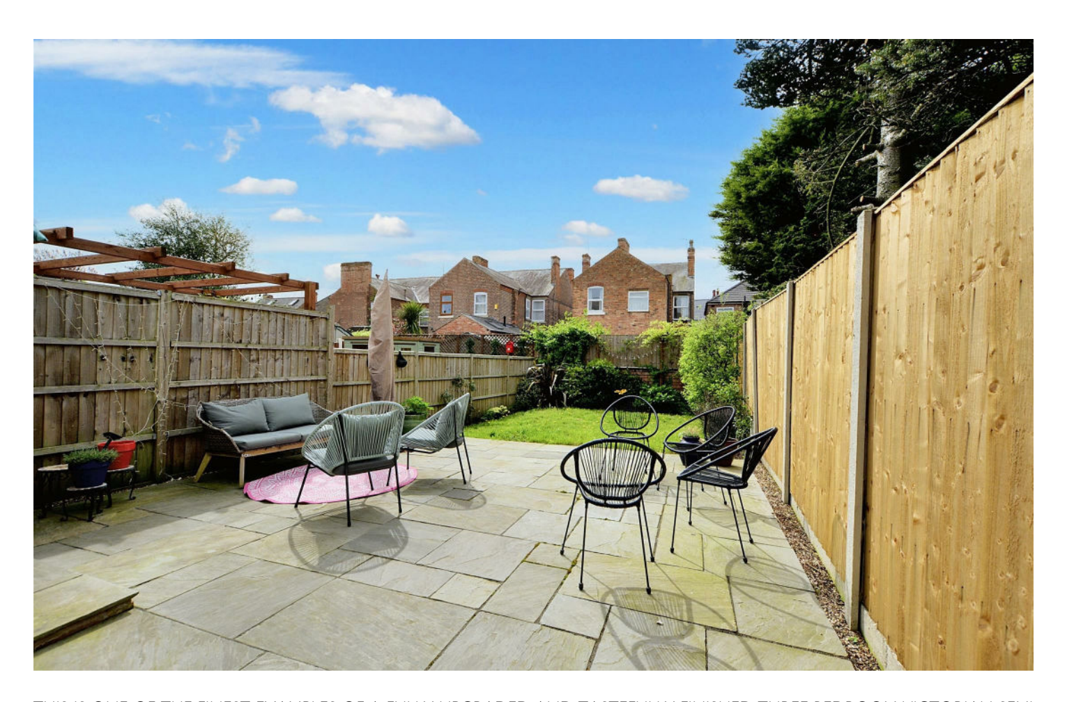
THIS IS ONE OF THE FINEST EXAMPLES OF A FULLY UPGRADED AND TASTEFULLY FINISHED THREE BEDROOM VICTORIAN SEMI DETACHED PROPERTY IN THE LONG EATON AREA.

Being located on Stafford Street, this lovely three double bedroom semi detached home provides ideal accommodation for a whole range of buyers, from people their first property through to families who are looking for a three bedroom home which is close to excellent local schools for younger children. For the size and finish of the property to be appreciated, we strongly recommend interested parties do take a full inspection so they are able to see the re-designed layout to the ground floor with the kitchen having been re-fitted over the past year and the newly created shower room to the first floor.