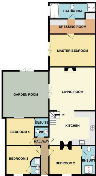
1ST FLOOR 82 sq.ft. (7.6 sq.m.) approx.