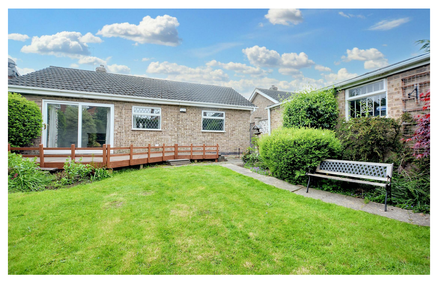
THIS IS A TWO DOUBLE BEDROOM DETACHED BUNGALOW SITUATED ON A QUIET CUL-DE-SAC IN THIS VERY POPULAR RESIDENTIAL AREA.

Being positioned on the right hand side of Balmoral Close, this detached bungalow is being sold with the benefit of NO UPWARD CHAIN and is therefore ready for immediate occupation. The property has recently been decorated throughout with new floor coverings to certain rooms and for the size of the accommodation and privacy of the rear garden to be appreciated, we recommend that interested parties do take a full inspection so they can see all that is included in this lovely home for themselves. The property is well placed for easy access to all the amenities and facilities provided by Sandiacre and Long Eaton and to J25 of the M1, which is again only a few minutes away from the property.