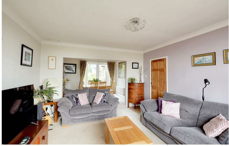
St. Helens Crescent Trowell, Nottingham NG9 3PZ