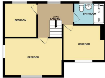
1ST FLOOR 435 sq.ft. (40.4 sq.m.) approx.