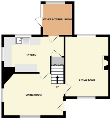
GROUND FLOOR 498 sq.ft. (46.2 sq.m.) approx.