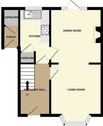
GROUND FLOOR 373 sq.ft. (34.7 sq.m.) approx.