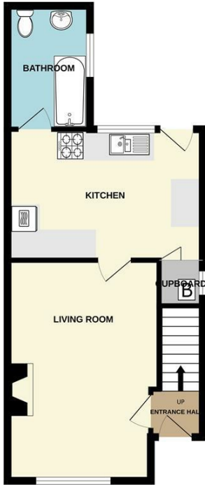
GROUND FLOOR 436 sq.ft. (40.5 sq.m.) approx.