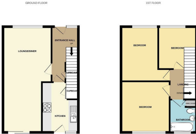
16 HADSTOCK CLOSE, SANDIACRE

While every effort has been made to ensure the accuracy of the floorplan contained here, measurements of doors, windows, rooms and any other items are approximate and no responsibility is taken for any errors, omissions or discrepancies. This plan is for illustrative purposes only and should not be used for any other prospective purposes. The services, systems and appliances shown hereon have not been tested and no guarantee is made their capacity or efficiency cannot be given. Made with Moneys' CO23