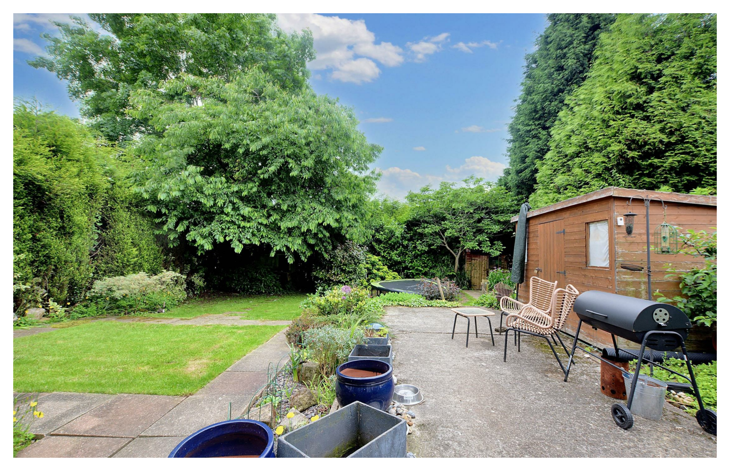
** IDEAL FAMILY PROPERTY **

Robert Ellis Estate Agents are delighted to offer to the market this EXTENDED FOUR BEDROOM, SEMI DETACHED HOME SITUATED IN THE HEART OF ARNOLD, NOTTINGHAM.