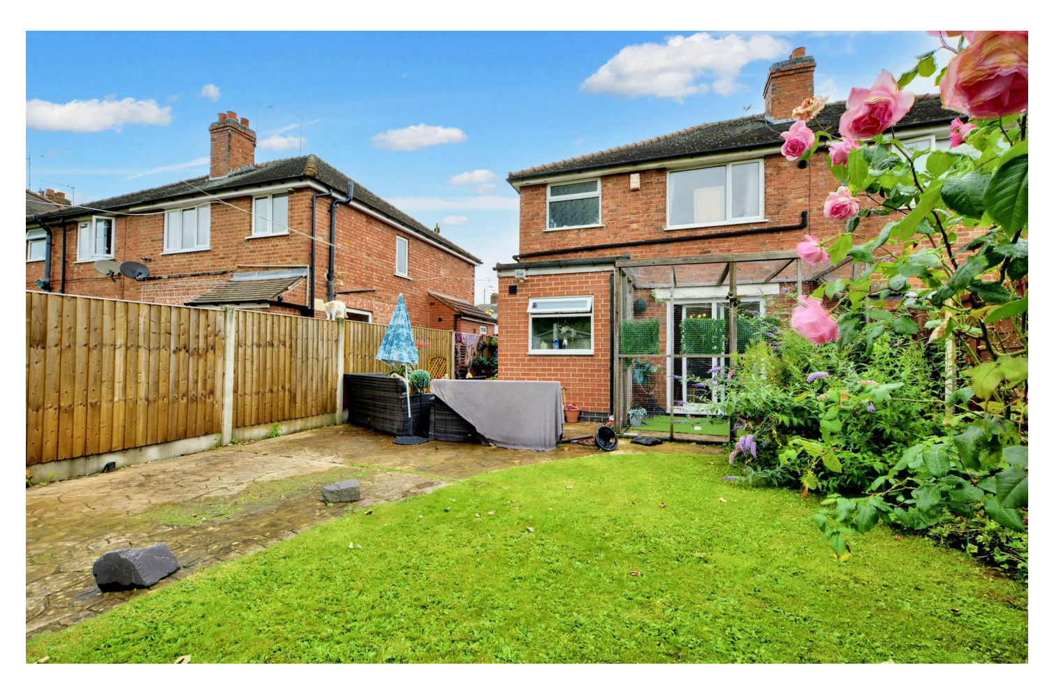
THIS IS A TRADITIONAL BAY FRONTED SEMI DETACHED HOUSE POSITIONED IN AN IDEAL LOCATION FOR EASY ACCESS TO AND FROM THE CENTRE OF LONG EATON.

Being situated on Meadow Lane, this traditional semi detached home provides spacious three bedroom accommodation which would suit a first time buyer or a family looking for a three bedroom home which is well placed for easy access to the amenities and facilities provided by the area. For the size of the accommodation and privacy of the rear garden to be appreciated, we recommend that interested parties do take a full inspection so they are able to see the whole property for themselves. The property is only a few minutes walk away from the centre of Long Eaton where there are excellent local shopping facilities and is also close to local schools for all ages which will be an important advantage to families young children.