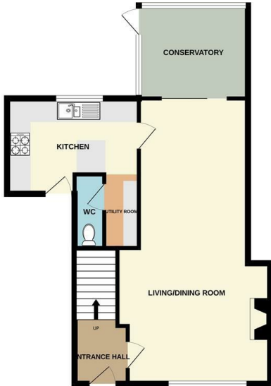
GROUND FLOOR 626 sq.ft. (58.1 sq.m.) approx.