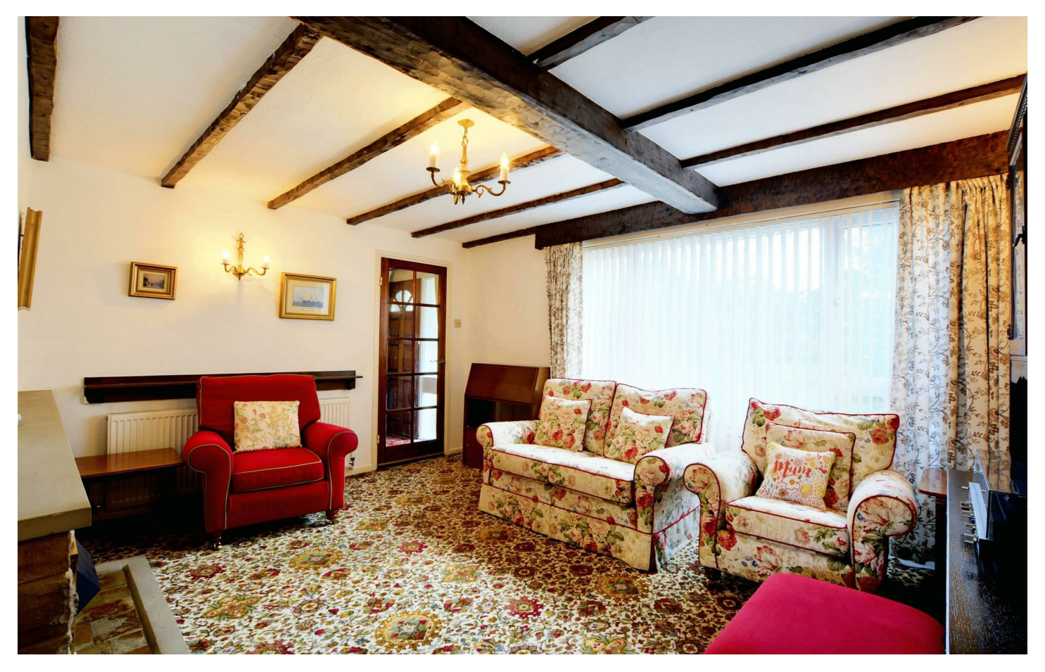
A spacious three bedroom detached house with a detached garage.

Situated in this sought-after and well established residential location in the heart of Bramcote Village, readily accessible for a wide range of local shops and amenities including schools, transport links, the A52 and M1 for further afield, this property is considered an ideal opportunity for a variety of potential purchasers including; first time buyers, young professionals, families and investors.