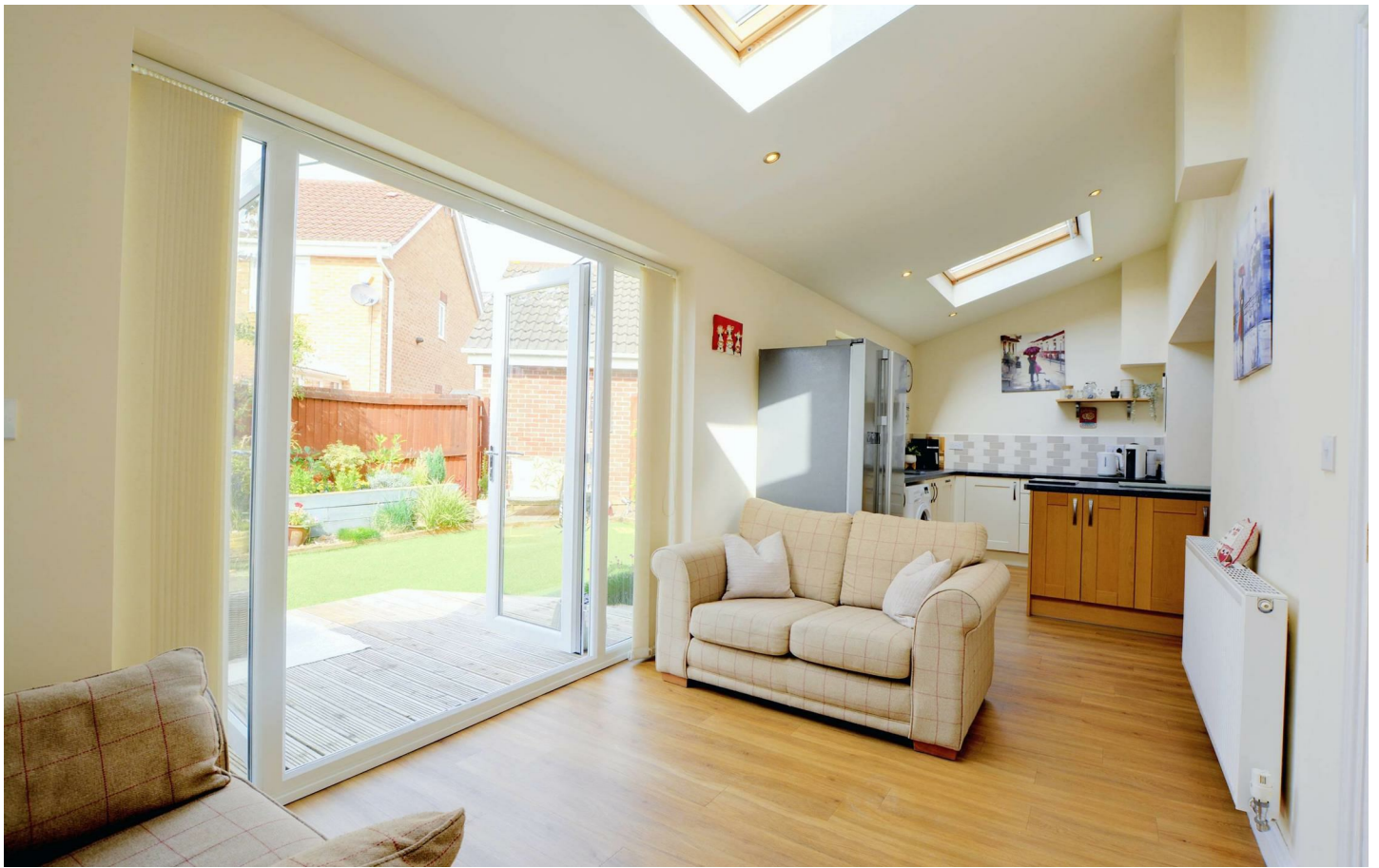
An Extended and Stylish Four Bedroom Double Bay Fronted Semi-Detached House.

Having been well maintained and upgraded by the current vendors, this excellent property now offers a most appealing and versatile living space, with a particularly impressive open plan kitchen diner and living area.