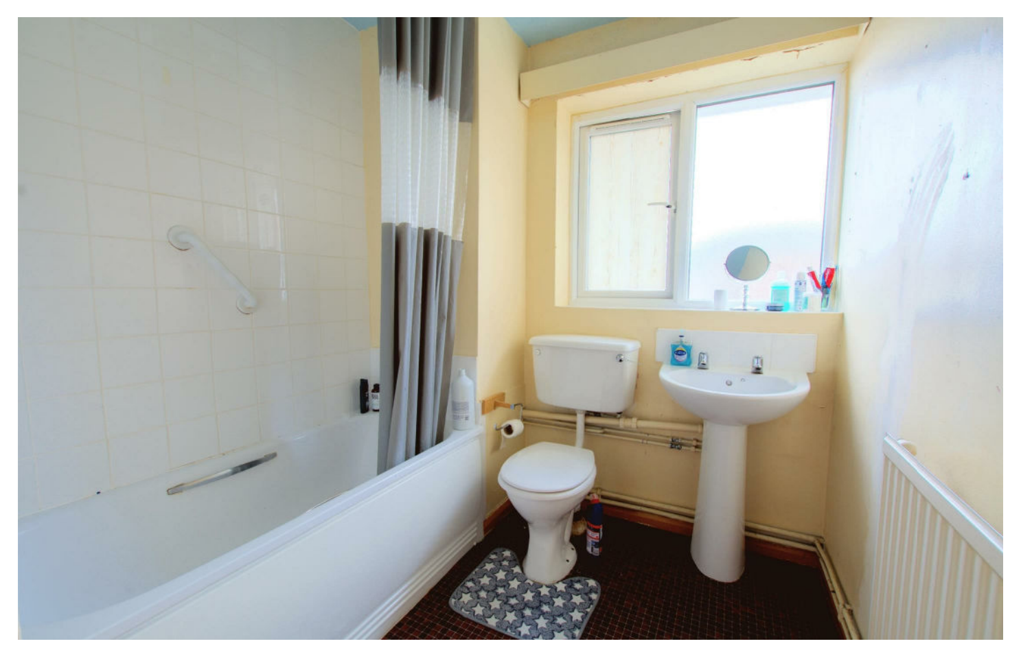
**CASH BUYER**BTL INVESTMENT**NO CHAIN**CLOSE TO NOTTINGHAM CITY CENTRE**

Robert Ellis are pleased to offer to the market this THIRD FLOOR TWO DOUBLE BEDROOM apartment with a balcony overlooking NOTTINGHAM!