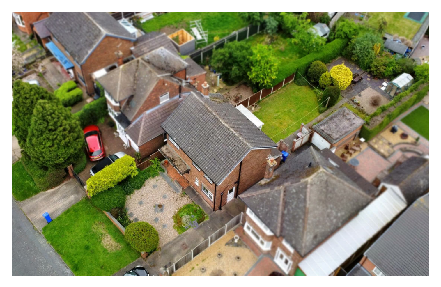
A SPACIOUS THREE BEDROOM DETACHED HOUSE WITH OFF STREET PARKING, GARDEN AND GARAGE, BEING SOLD WITH NO UPWARD CHAIN.

Robert Ellis are delighted to bring to the market this spacious detached home offering ample space, both inside and out. Situated within a desirable location in Long Eaton, the property is situated along the service road, away from the road and set back via driveway and parking.