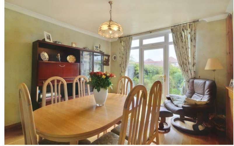
Burnbreck Gardens Wollaton, Nottingham NG8 2FY