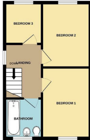
1ST FLOOR 344 sq.ft. (32.0 sq.m.) approx.