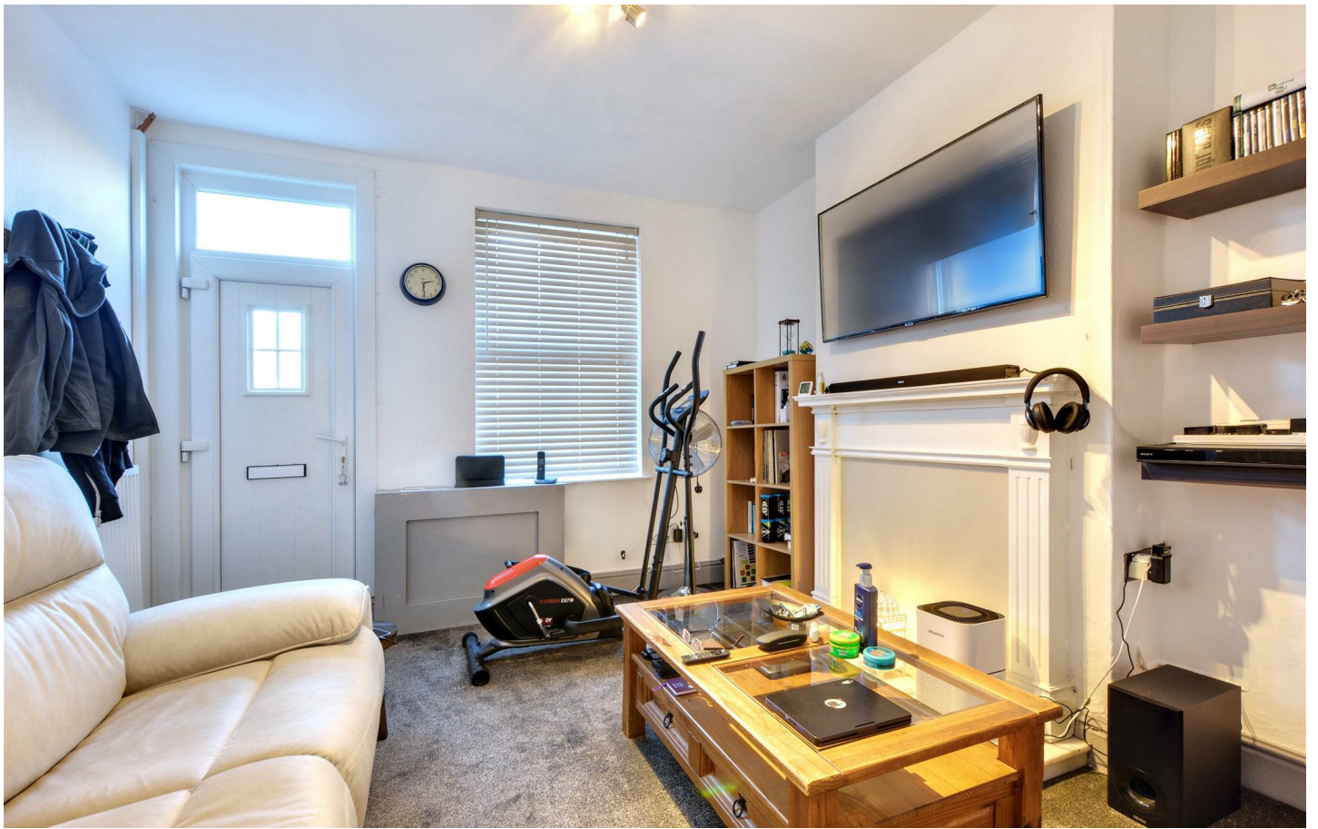
Beautifully modernised Victorian one-bedroom terraced home with a versatile loft room, tucked away on a peaceful cul-de-sac in the ever-popular Gedling Village.