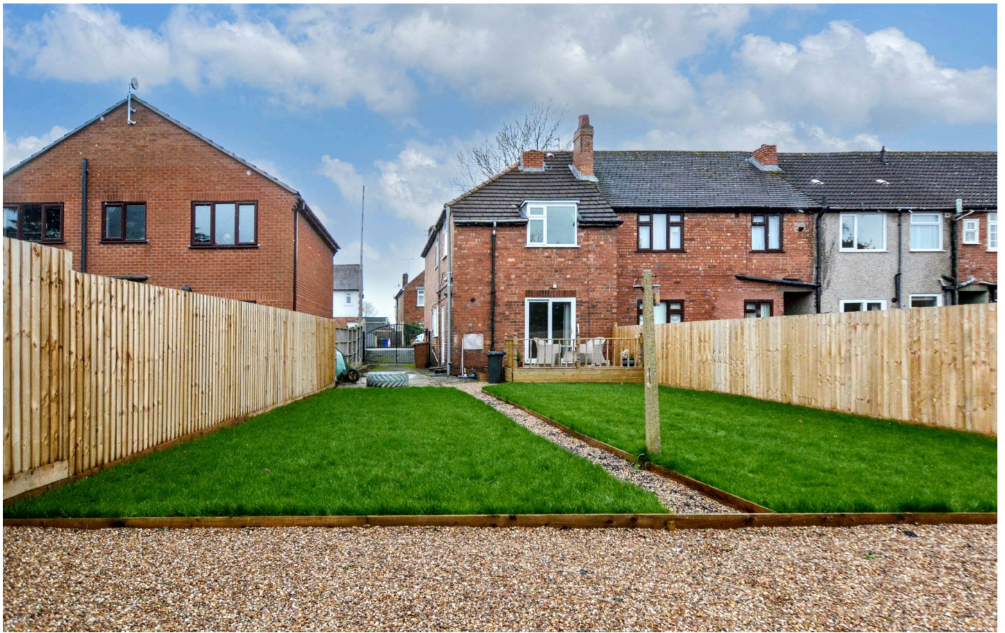
A THREE BEDROOM END PROPERTY FOUND ON A CUL-DE-SAC, IN NEED OF UPDATING AND MODERNISATION.

This three-bedroom end-terrace property is situated on a quiet cul-de-sac in the popular town of Long Eaton, conveniently located within walking distance of Long Eaton train station, local shops, and well-regarded schools. The property requires updating and modernisation throughout, offering an excellent opportunity for buyers to personalise and add value. With its end-terrace position, the home benefits from additional space and presents strong potential for extension, subject to the necessary planning permissions. Offered for sale with no upward chain, this property represents an ideal purchase for first-time buyers, investors, or those looking for a project in a highly convenient and sought-after location.