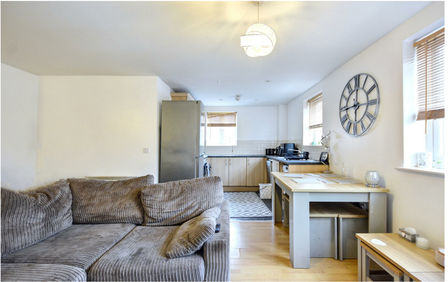
A MODERN TWO BEDROOM APARTMENT, IDEAL FOR A FIRST TIME BUYER OR INVESTOR, LOCATED WITHIN EASY REACH OF LOCAL AMENITIES AND EXCELLENT TRANSPORT LINKS.

Robert Ellis are delighted to bring to the market this well-presented apartment, built in 2007 and offering comfortable, low-maintenance living. The accommodation comprises an open plan lounge and kitchen, creating a bright and sociable living space, along with two bedrooms and a three-piece bathroom suite. The property also benefits from allocated parking, making day-to-day life convenient. Situated within walking distance of local shops and the train station, the apartment offers superb access to Nottingham, Derby and wider transport routes, making it a fantastic opportunity for first-time buyers, professionals or buy-to-let investors. Early viewing is recommended.