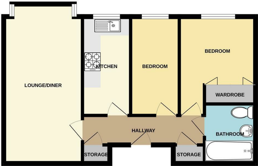
42 SANDBY COURT, CHILWELL

Whilst every attempt has been made to ensure the accuracy of the floorplan contained here, measurements of doors, windows, rooms and any other items are approximate and no responsibility is taken for any error, omission or mis-statement. This plan is for illustrative purposes only and should be used as such by any prospective purchaser. The services, systems and appliances shown have not been tested and no guarantee as to their operability or efficiency can be given. Made with Metropix ©2023