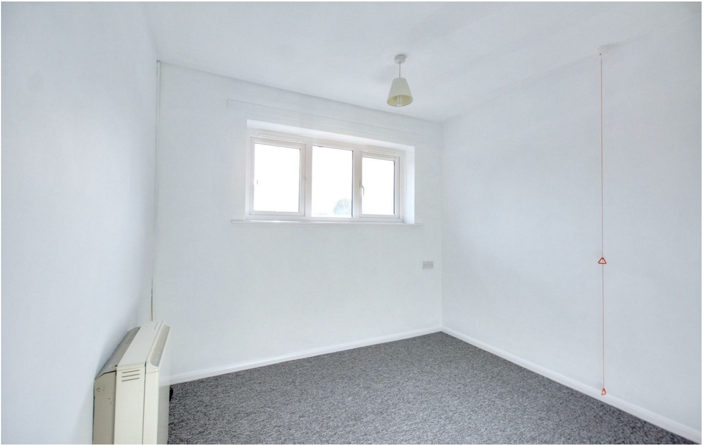
A two bedroom second floor flat situated in a popular warden aided development.

Exclusively for occupants over the age of 55 that are retired, this purpose built development benefits from a communal lounge area with kitchen facility, laundry and garden and is well placed for the tram and a doctors surgery.