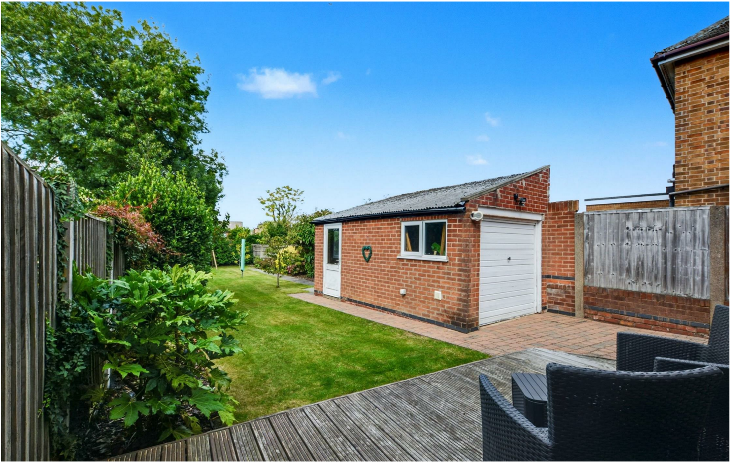
A TRADITIONAL DOUBLE HEIGHT BAY FRONTED HOFTON BUILT THREE BEDROOM SEMI DETACHED HOUSE.

Robert Ellis are delighted to welcome to the market this traditional Hofton built double height bay fronted three bedroom semi detached house situated within this popular and established residential location.