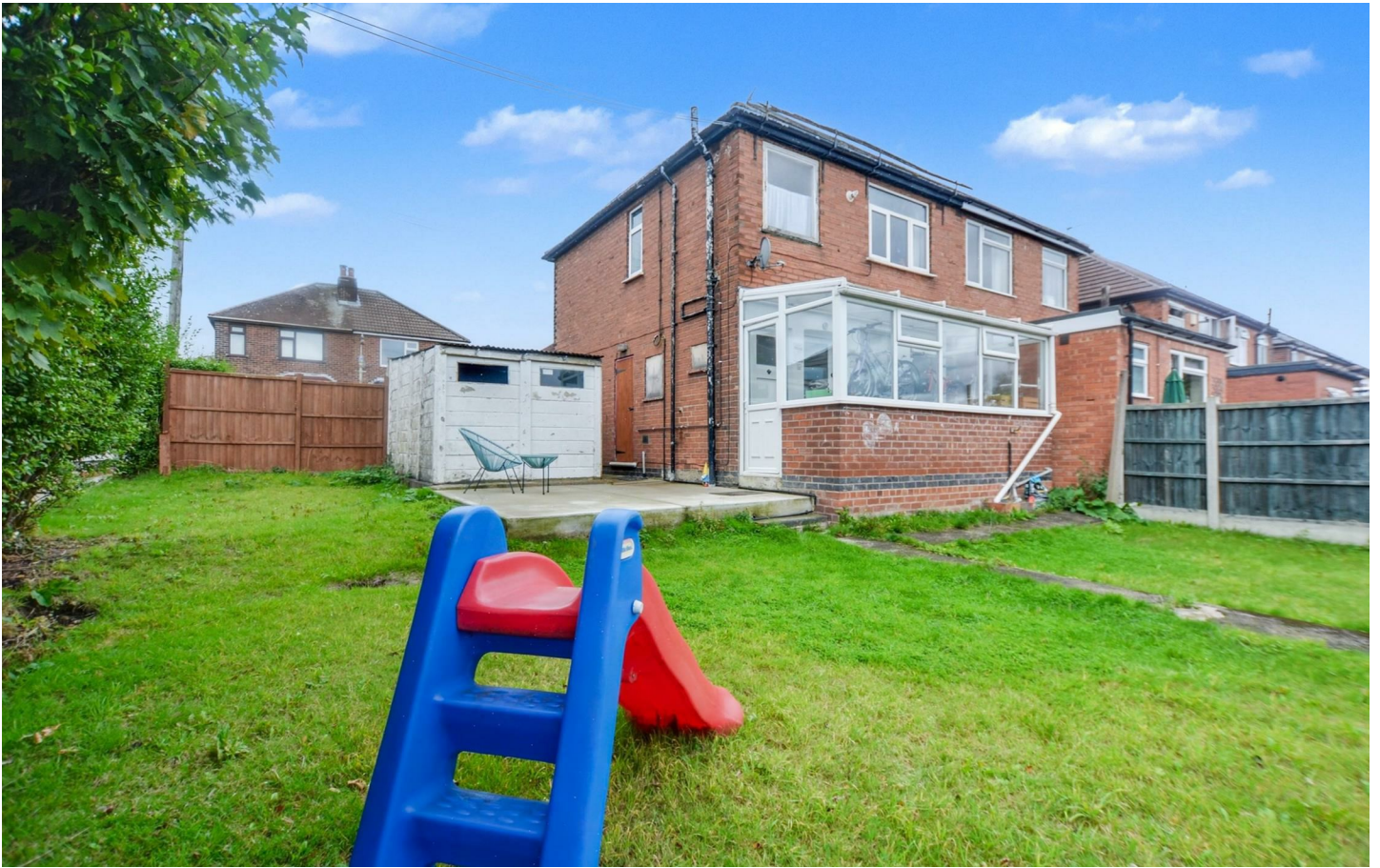
A TRADITIONAL BAY FRONTED, TWO BEDROOM SEMI DETACHED HOUSE.

Robert Ellis are pleased to bring to the market this traditional bay fronted, two bedroom semi detached house situated within the popular village of Trowell.