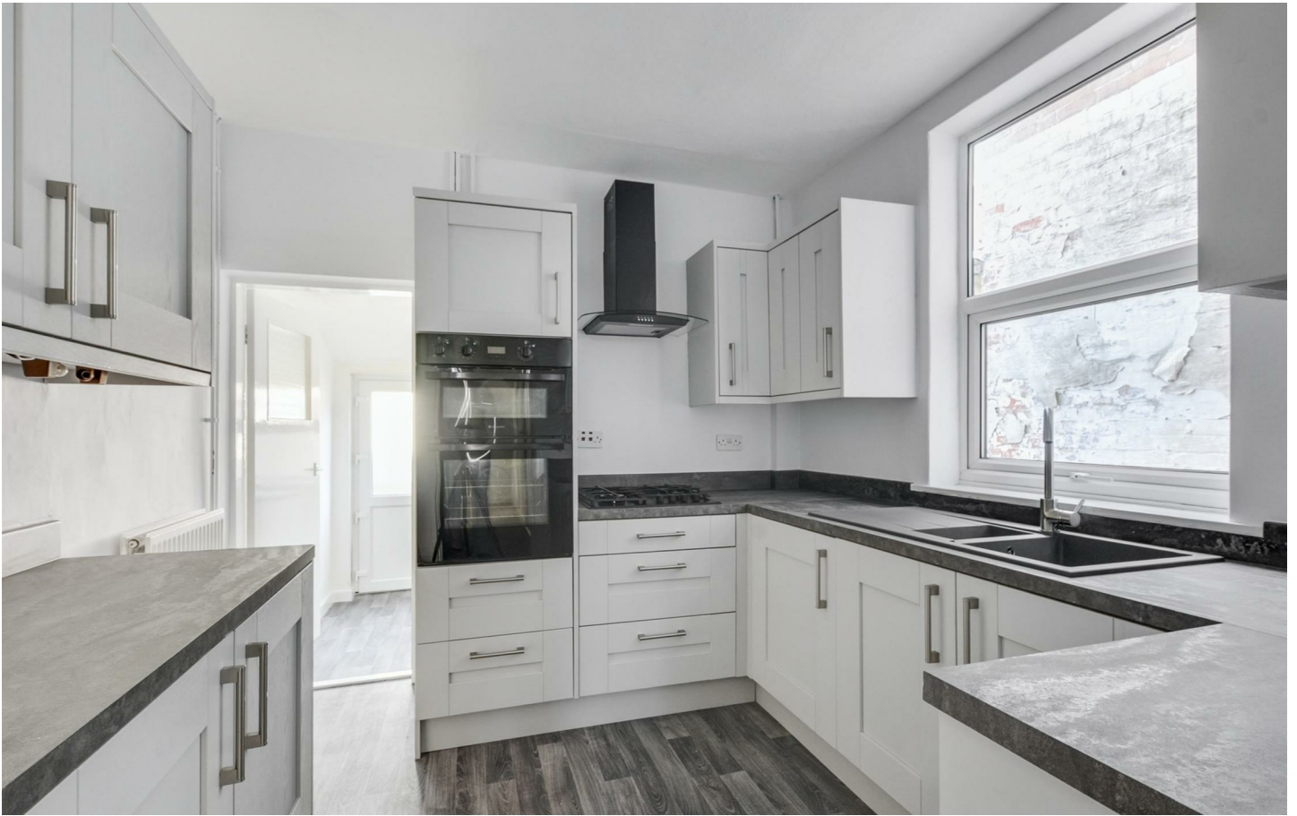
A surprisingly spacious two double bedroom mid terraced house.

This large period property benefits from a brand new fitted kitchen with built-in oven, hob, fridge and freezer. There are new floor coverings to the ground floor and has been recently decorated. The property also benefits from central heating served from a combination boiler and double glazed windows.