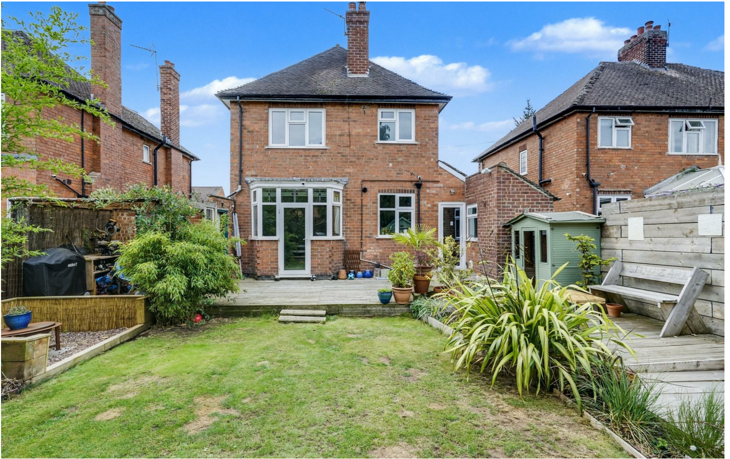
A TRADITIONAL BAY FRONTED DETACHED HOUSE THAT HAS BEEN EXTENDED AND IS IN A SOUGHT AFTER LOCATION.

This appealing property is set back from the road and has a block paved driveway providing off road for two vehicles and access to the single garage. The entrance porch is double glazed and leads to the original front door with a feature decorative glazed light panel within and decorative leaded windows either side. The entrance hallway has the original wooden flooring and stairs rising to the first floor and door access to the two reception rooms and kitchen. The dining room has a feature period fireplace, stripped wooden floor boards and walk in bay window to the front elevation. The living room has a feature working open fireplace with ornate timber surround and a double glazed door that opens to the rear garden. The breakfast kitchen is modern fitted and has a feature tiled wall and a original storage cupboard with shelving and drawers, the cloakroom is accessed off the kitchen. The first floor landing provides access to two double and one single bedroom, family bathroom and stairs leading to the second floor. The second floor landing leads to two single bedrooms and both have Velux skylights. The rear garden offers an excellent level of privacy and has various seating areas, timber storage shed, covered BBQ area and a timber hut with sauna. This property would appeal to a variety of buyers that are looking for a period detached property in a favoured location.