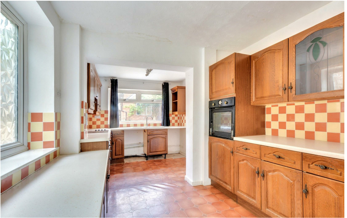
An extended three-bedroom detached house offering great potential.

Situated on a generous and private corner plot, with a drive to the rear, this excellent house offers a fabulous opportunity for any potential purchaser to remodel, and potentially extend, subject to the necessary consents.