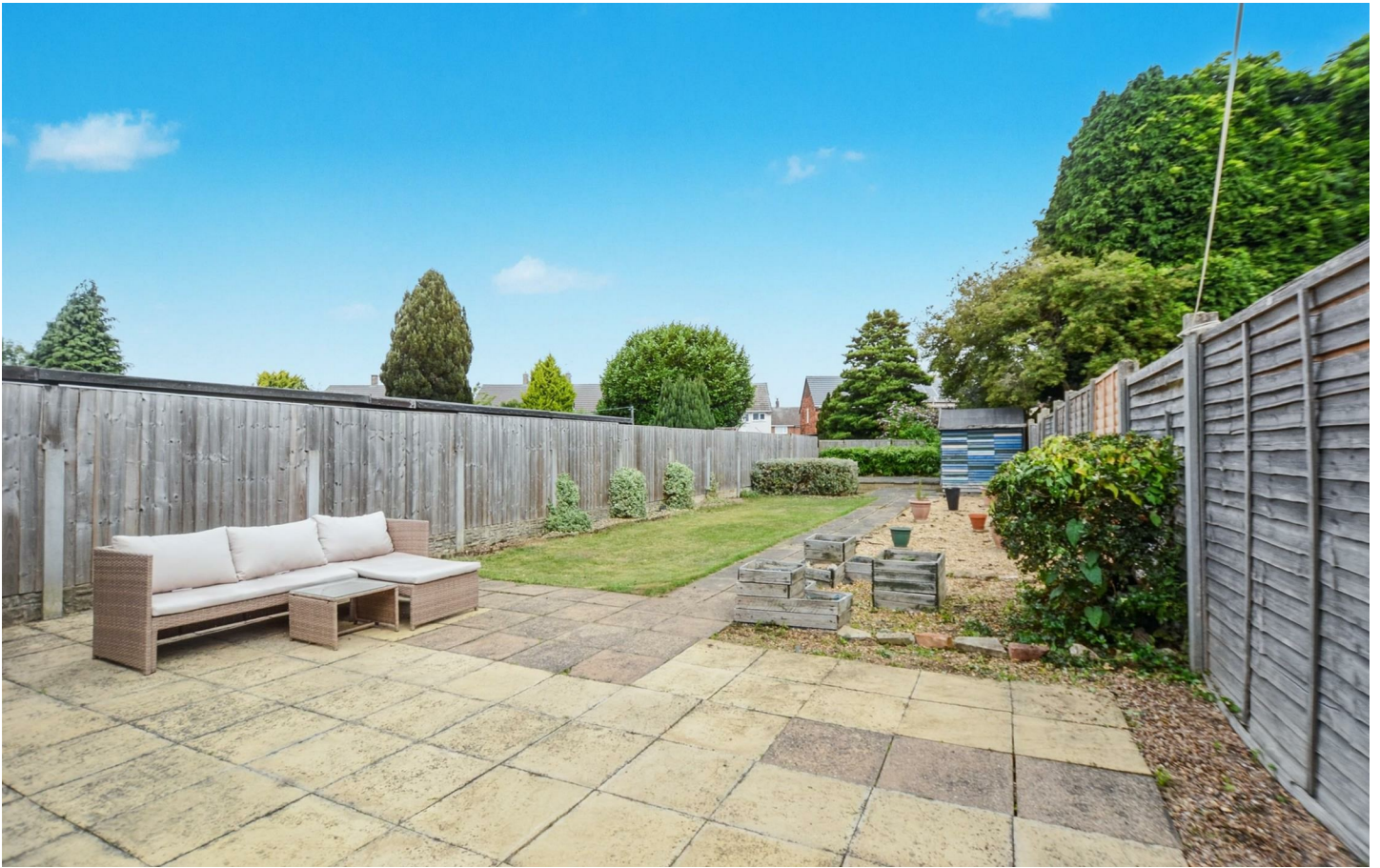
THIS IS A TWO DOUBLE BEDROOM SEMI DETACHED HOUSE WITH BLOCK PAVED OFF THE ROAD PARKING AT THE FRONT AND A LONG PRIVATE GARDEN TO THE REAR.

Robert Ellis are pleased to be instructed to market this traditional two double bedroom property which we feel will suit a whole range of buyers, from people buying their first property through to young families who are looking for a property which is close to excellent local schools and other amenities and facilities. An important feature of this lovely home is the size of the rear garden and for this and the layout and size of the accommodation to be appreciated, we recommend interested parties do take a full inspection so they can see all that is included in the property for themselves.