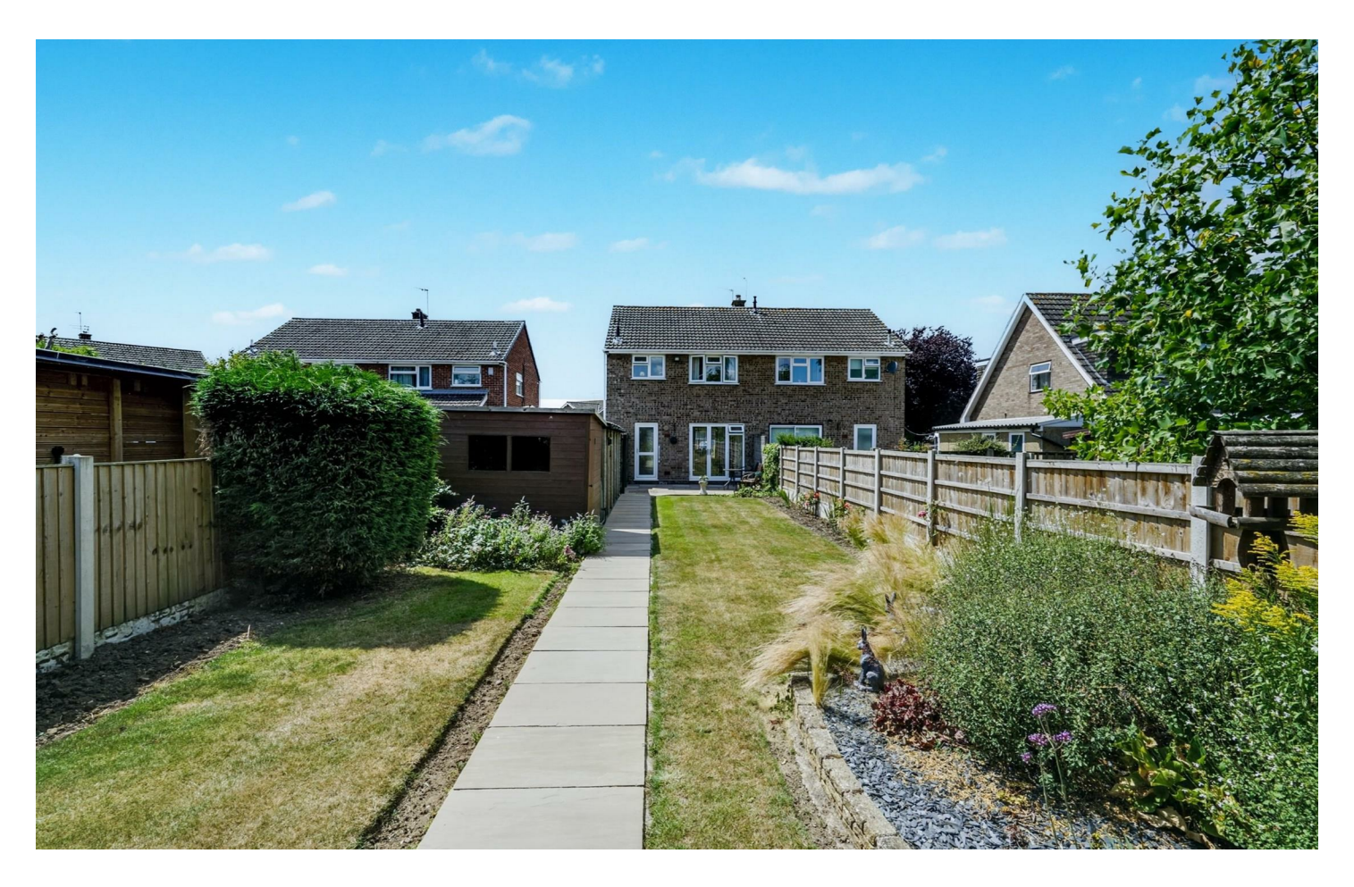
THIS LOVELY THREE BEDROOM PROPERTY IS SITUATED IN THE HEART OF THIS MOST SOUGHT AFTER RESIDENTIAL AREA ON THE OUTSKIRTS OF LONG EATON.

Being situated on Lathkilldale Crescent, which is a very popular road within the Dales estate, this traditional three bedroom semi detached property provides a lovely home which has a long private garden at the rear of the house. The property is being sold with the benefit of NO UPWARD CHAIN and for the size and layout of the well cared for accommodation and length of the rear garden to be appreciated, we recommend that interested parties take a full inspection so they can see all that is included in this lovely home for themselves. The property is well placed for easy access to excellent local amenities and facilities including schools and shopping facilities in the town centre and therefore is a very popular and convenient place to live.