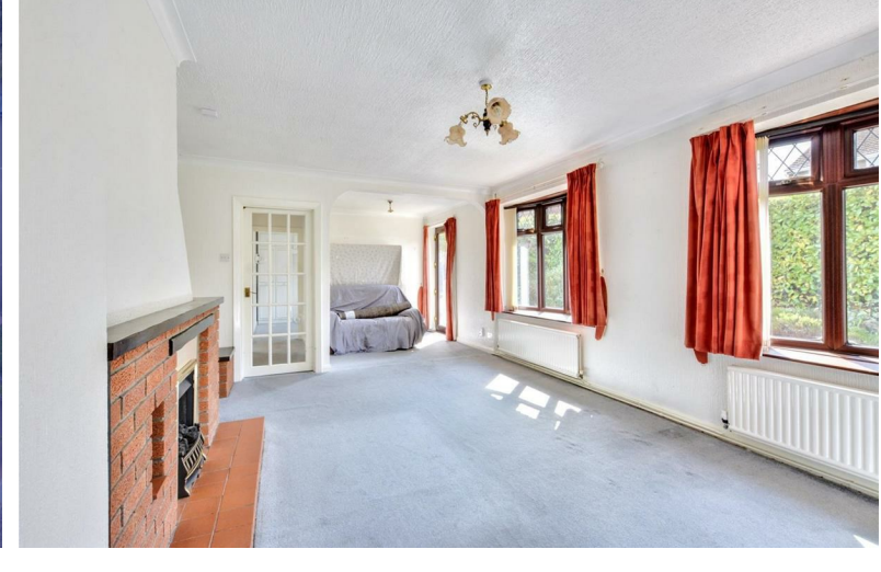
Braefield Close Kirk Hallam, Derbyshire DE7 4JS