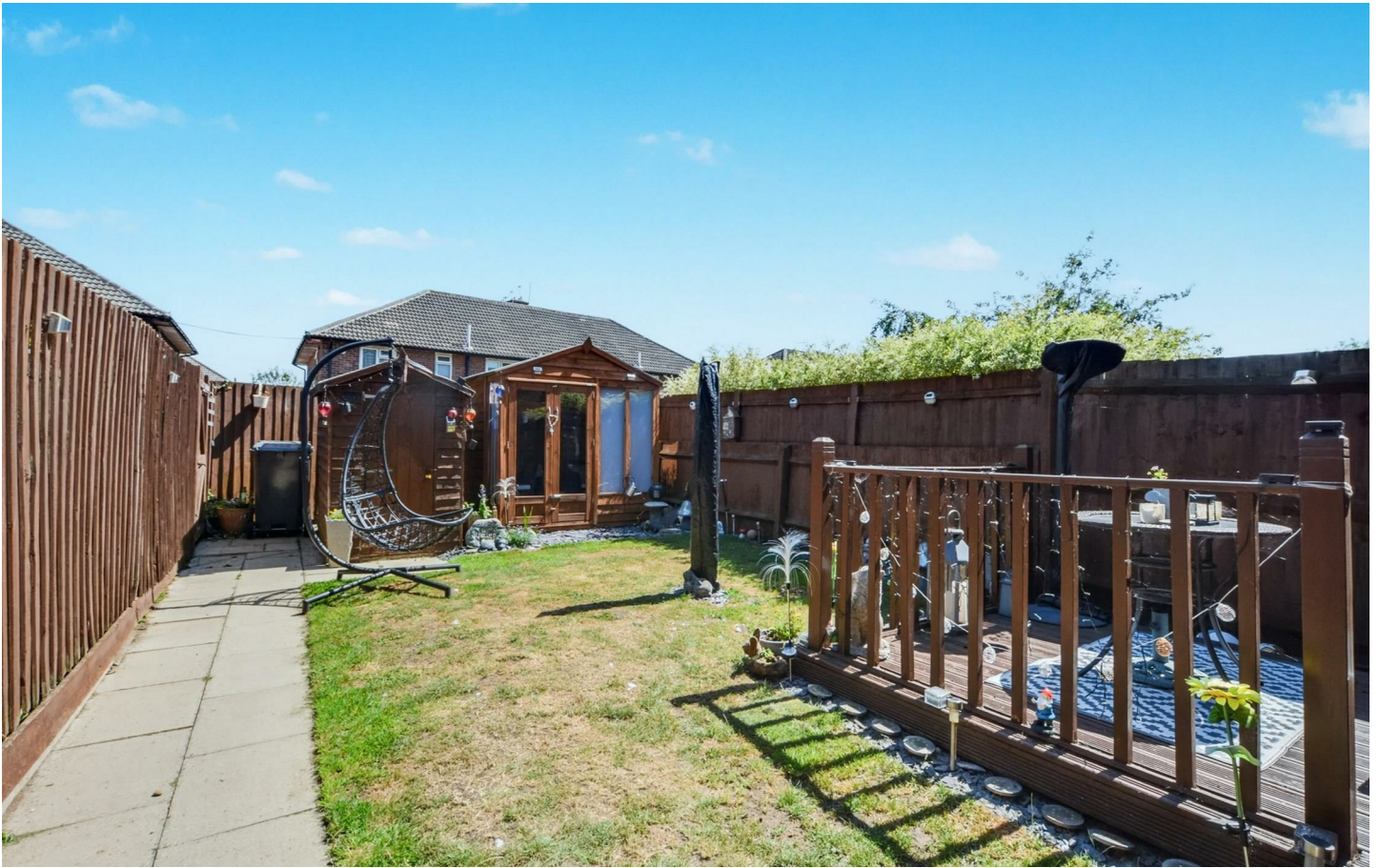
A TWO BEDROOM PROPERTY FOUND IN A CUL-DE-SAC LOCATION.

Robert Ellis are delighted to offer to the market a wonderful opportunity to purchase a 25% SHARED OWNERSHIP property within Sawley. Situated in a quiet cul de sac, the property is ideal for a first time buyer, offering two bedrooms and great sized living accommodation to the ground floor including a spacious kitchen diner and downstairs WC. The property is ideally positioned for local shops and amenities including local bus routes. Also great access for link roads such as the A50 and M1 are within easy access.