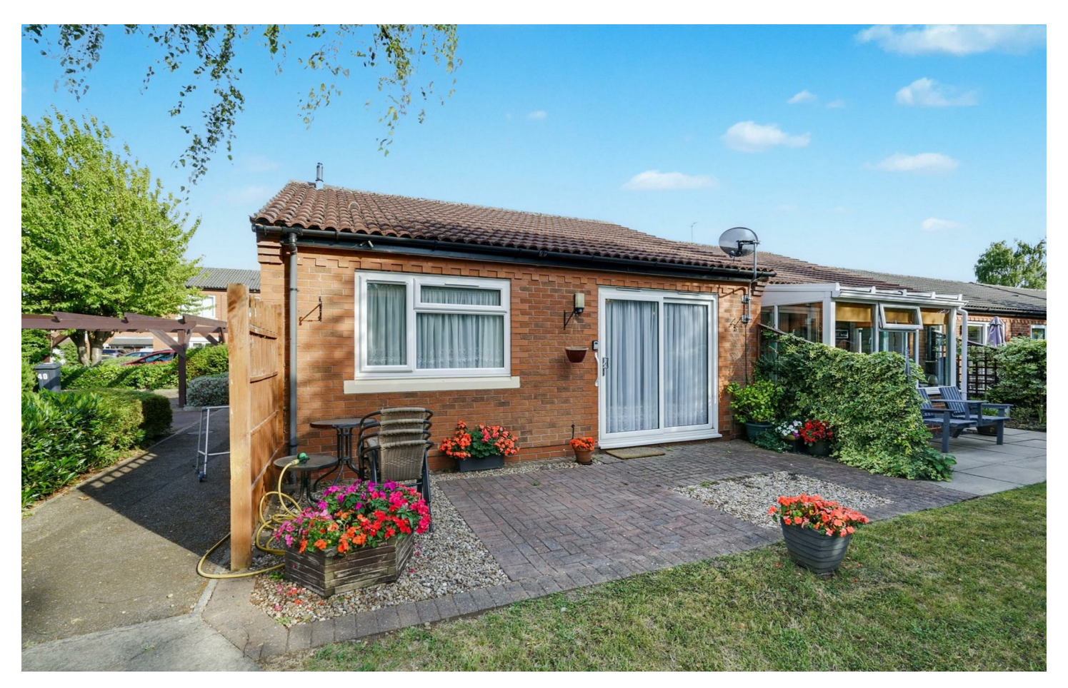
THIS IS A LOVELY, WELL APPOINTED TWO BEDROOM BUNGALOW, IN WHICH WE ARE SELLING A 75% SHARE, SITUATED WITHIN THE CAVLERTON CLOSE RETIREMENT DEVELOPMENT.

Being located in the heart of Toton and close to the Tesco superstore on Swiney Way, this two bedroom end property will provide a lovely home for someone who is looking for a retirement property in the West Nottingham area. The property has been updated throughout and is being sold with the benefit of NO UPWARD CHAIN is ready for immediate occupation. For the size and layout of the accommodation and privacy of the patio area at the rear to be appreciated, we recommend that interested parties take a full inspection so they can see all that is included in this lovely bungalow for themselves.