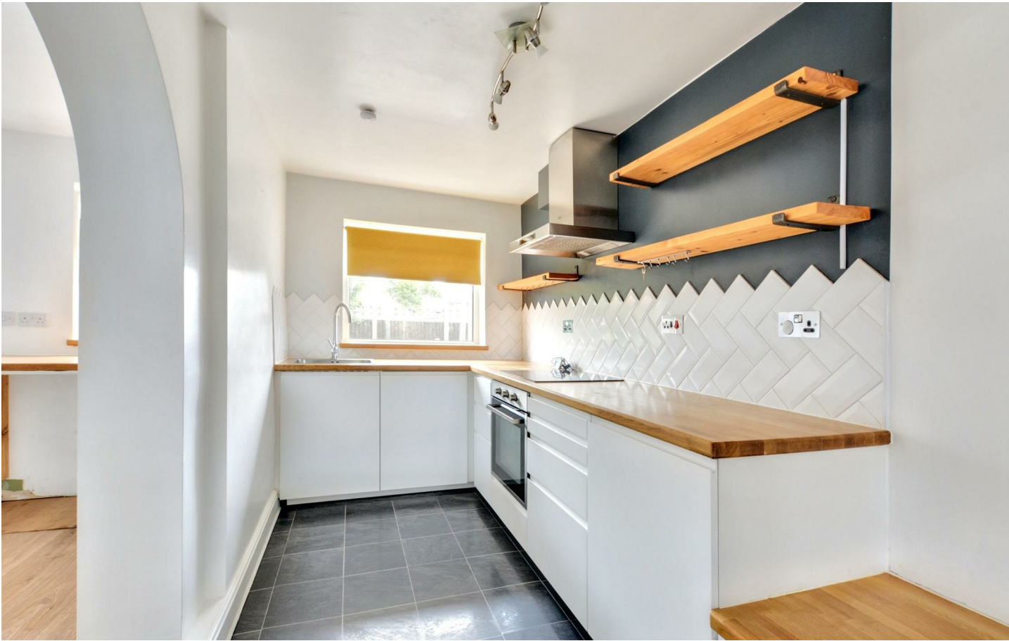
An extended and versatile, three-bedroom detached house with a contemporary interior.

Benefitting from a large lounge, kitchen diner, and conservatory, this deceptive house, is offered to the market with the benefit of chain free vacant possession, and is considered ideal for the needs of a growing family, though will appeal to a variety of potential purchaser.