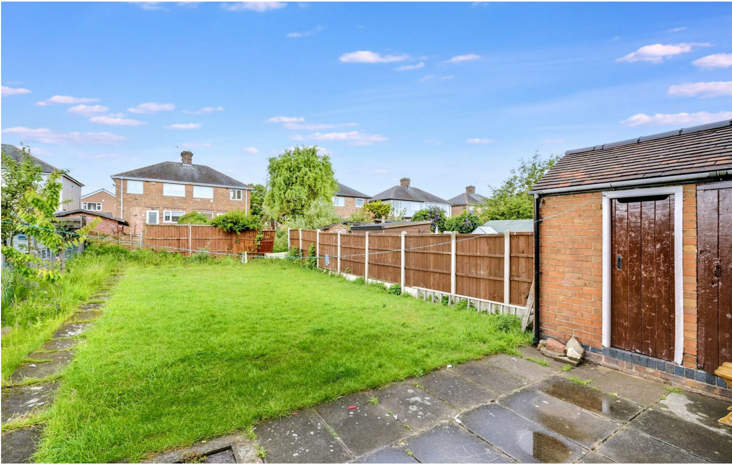
A TRADITIONAL BAY FRONTED SEMI DETACHED HOUSE PROVIDING THREE BEDROOM ACCOMMODATION WHICH HAS BEEN EXTENDED TO THE SIDE.

Being located on Bennett Street, this traditional bay fronted semi detached property will provide a lovely home for a whole range of buyers, from people buying their first property through to families who are looking for three bedrooms and a home which is within easy reach of excellent local schools and other amenities and facilities provided by the area. For the size and layout and the privacy of the rear garden to be appreciated, we recommend that interested parties take a full inspection so they can see all that is included in the property for themselves. As well as local schools the property is only a few minutes drive away from Long Eaton town centre and to excellent transport links, all of which have helped to make this a very popular and convenient place to live.