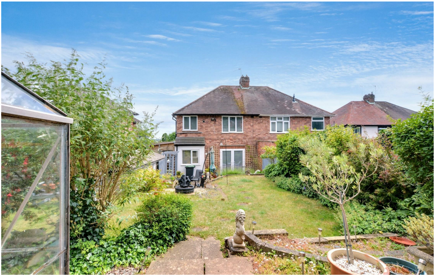
A WELL PRESENTED BAY FRONTED HOME IN A SOUGHT AFTER LOCATION.

Robert Ellis are delighted to offer to the market this well presented traditional semi detached home offers a perfect blend of character and modern comfort. Situated in a highly desirable area, the property boasts off road parking and a generous rear garden, making it an ideal choice for a range of buyers. The home features three bedrooms and two spacious reception rooms to the ground floor, with a bay-fronted dining room adding a classic charm and floods the space with natural light, while the second reception room offers a perfect space for the living room overlooking the rear garden. Upstairs, the property continues to impress with well-proportioned bedrooms and a clean, contemporary finish throughout. Outside, the large rear garden is a true highlight—beautifully maintained and featuring an elegant Swedish-style seating area, ideal for outdoor dining or unwinding in style. Additional benefits include a detached garage (currently not accessible for vehicle use), and the excellent location puts you just a short distance from the tram network, local amenities, and major transport links including the A52.